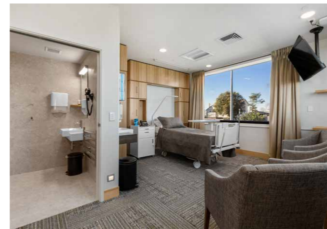
Braemar Hospital Nikau Wing fitout