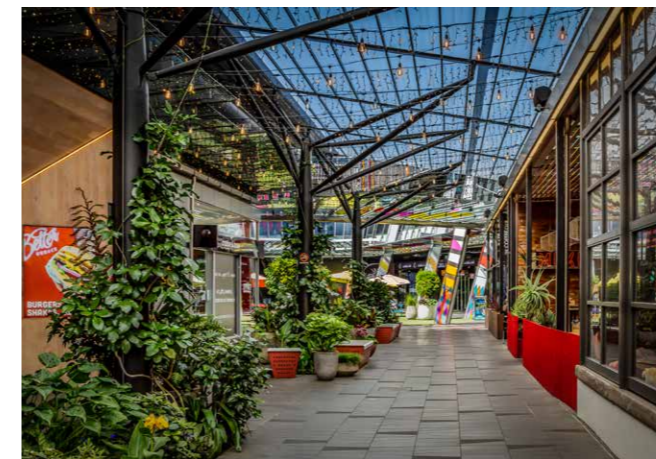
Sylvia Lane dining precinct

"I find the working relationship between Gibbons Naylor and Gibbons extremely enjoyable and transparent, and the commitment and engagement with everyone involved has been a pleasure."