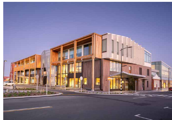
Ashburton Library & Civic Centre