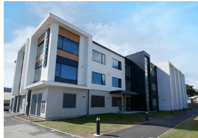
Anscombe Village Stage 1