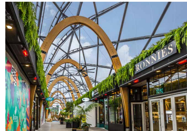
Botany Town Centre Garden Lane