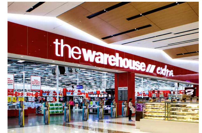
The Warehouse, Sylvia Park