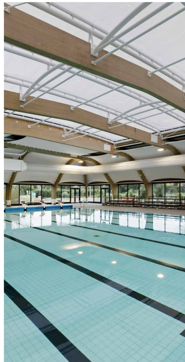
Rotorua Aquatic Centre