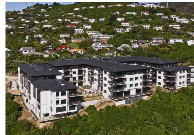
Bupa Crofton Downs