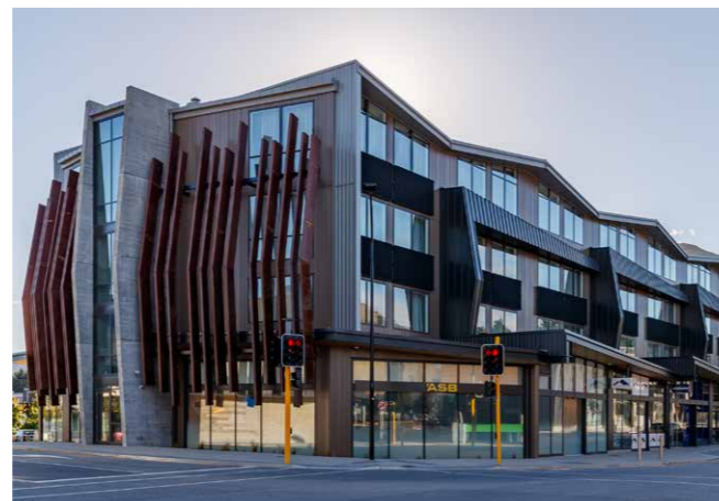
Sudima Queenstown Five Mile