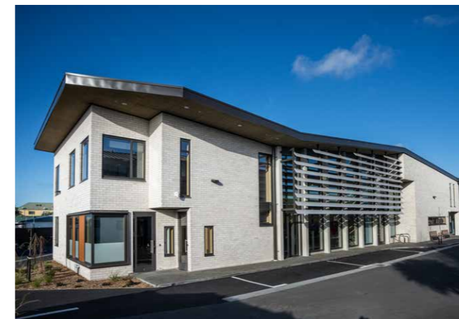
Christchurch City Mission