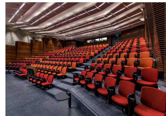
UoO Wellington Lecture Theatres

Manager Project Delivery, University of Otago