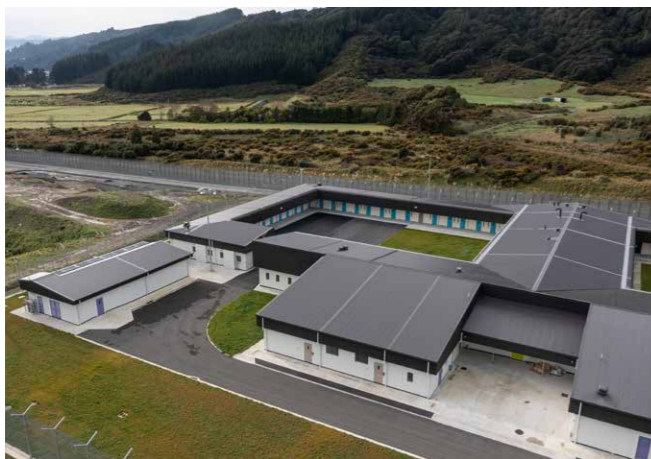
Rimutaka Prison modular build