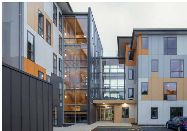
Otago Polytechnic Student Village