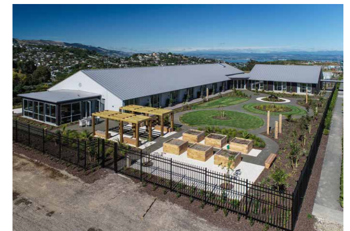
Coastal View dementia centre