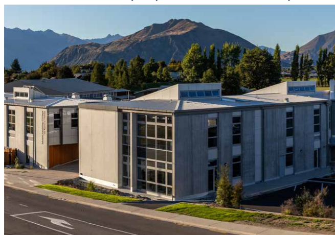
Mount Aspiring College