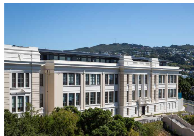
Matairangi, Wellington East Girls' College