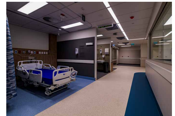
Wellington Hospital Urology & Renal