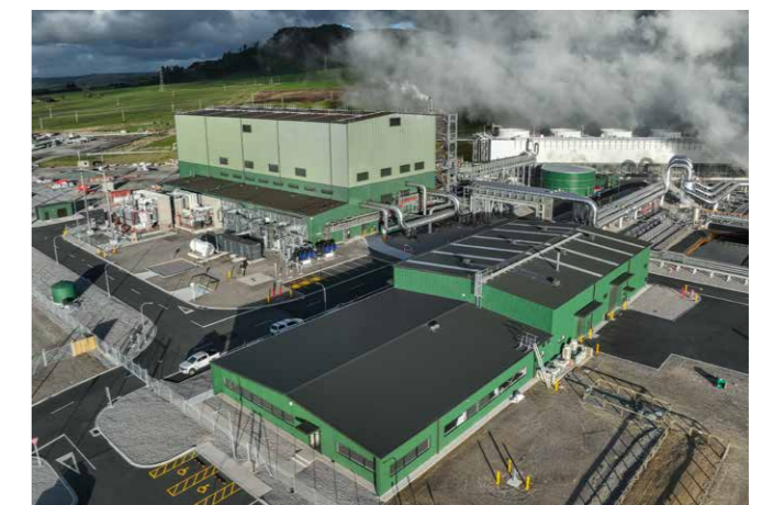
Tauhara geothermal power station