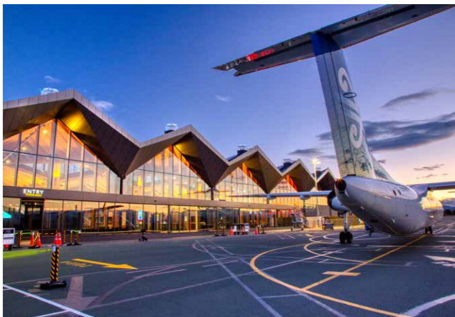
Nelson Airport Terminal