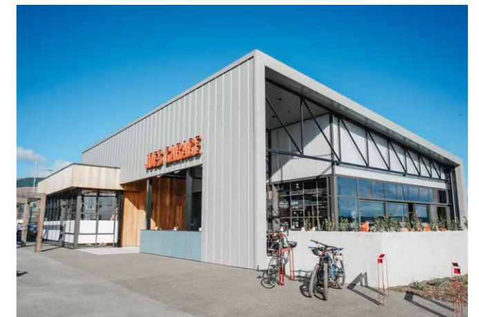
Joe's Garage Berryfields